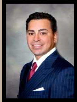
From the President

“As always, we appreciate your business.”