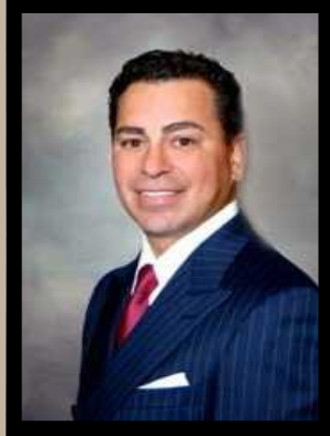
From the President

“Colonial Lloyds now offers the Preferred Credit on their HOB form. . .”